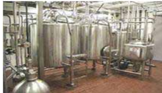
Fig.3.7.1: Milk processing plant

Autonomy in Pricing : The dual pricing policy of the private dairies results in diversion of milk by the producers to the neighbouring milk deficit States. The low procurement