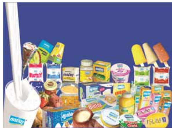
Fig.3.7.3: Product Diversification

Totally an amount of ₹656.38 crore is proposed as outlay for the Dairy Development Sector, of which an amount of ₹339.28 crore as State fund as shown in Table 3.7.3. However, additional schemes for the development of this sector will be taken up through funding from NDDDB, NABARD, Ministry of Food Processing Industries, GOI and own funds of MPCs and Unions.