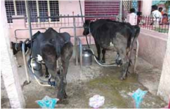
Fig.3.7.2: Clean milk production

ensure stable growth in procurement and marketing