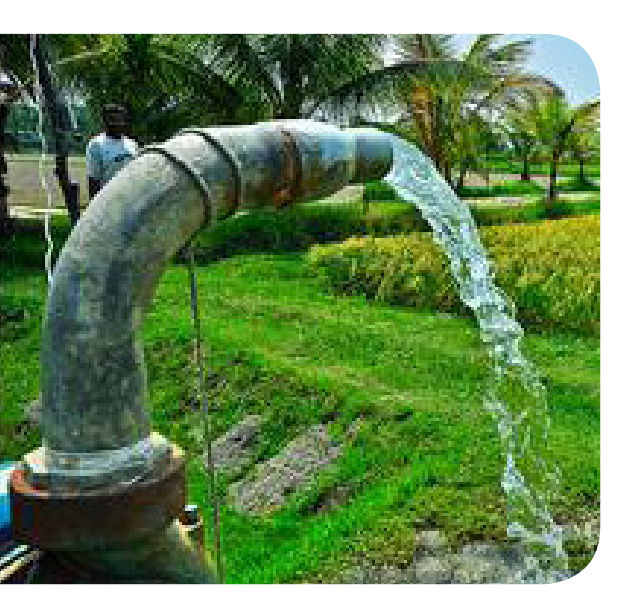
FIGURE 2 Research in Asia has found a reduction in Global Warming Potential of 43% associated with AWD. (Data from a meta-analysis by Sanchis et al. 2012.)

On-farm experiments with AWD in the Central Luzon region of the Philippines underpinned the differing incentives for AWD adoption. Canal-irrigated farms had little reduction in CH_4 emissions. Because they paid a flat fee for their water, there was little incentive to reduce irrigation, and the farmers rarely allowed their fields to drain completely. In contrast, CH_4 emissions on pump-irrigated farms decreased by nearly 70% under AWD. Once farmers were confident that the practice would not reduce yields, they used it as an opportunity to reduce money spent on fuel for pumping.