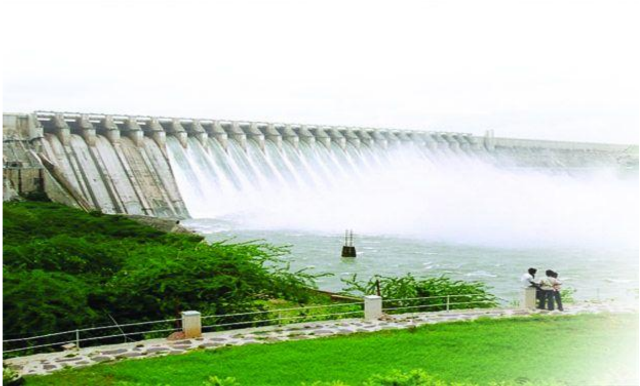
Nagarjuna Sagar - Telangana

Hyderabad: The monsoon, if it comes in the next three days, will literally be a godsend as the water levels in Telangana reservoirs are dwindling fast.