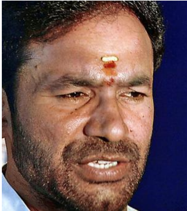
G. Kishan Reddy

'Govt. should issue instructions to banks stating its policy on loan waiver'