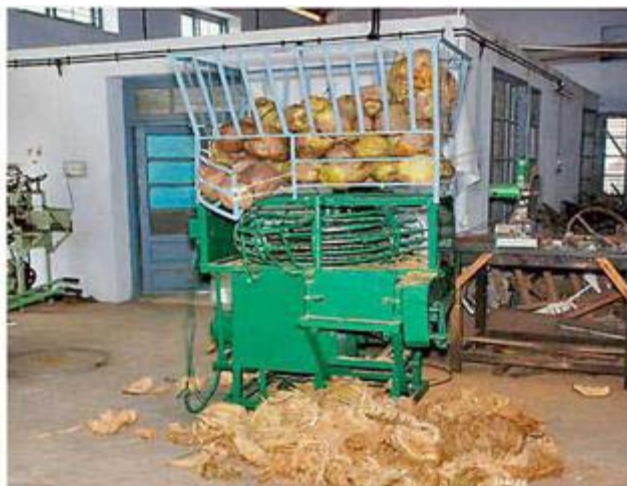
An exhibit at the technology meet to begin at Kerala Agricultural University (KAU) in Thrissur on Saturday.

THRISSUR, March 1, 2014 - A technology meet, to begin on Saturday, at ‘Agrifesta 2014’, an agricultural exhibition and technology meet, will showcase farm models and products.