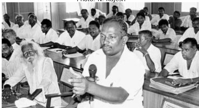
Relief: A farmer speaking at the grievance day meeting in Tuticorin on Thursday.

Tuticorin: Farmers have demanded compensation for the banana trees that were destroyed by a gale on April 7.