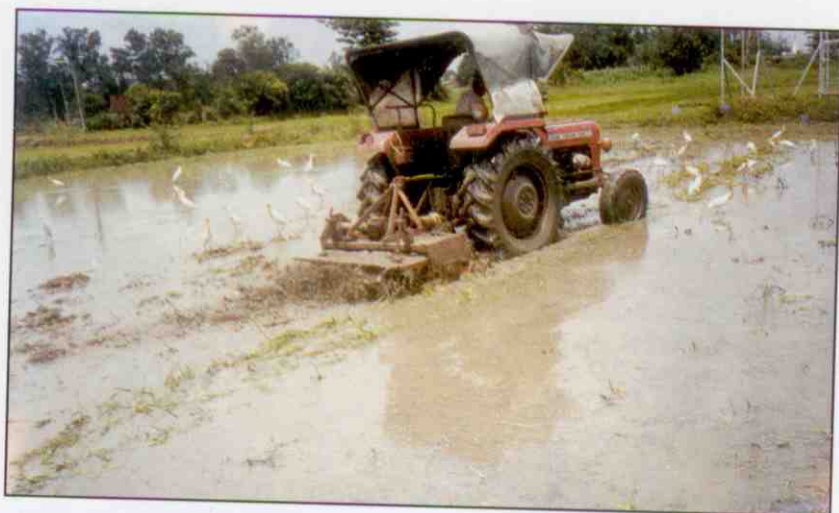
Fig 2 Field testing of Tractor Mounted rotavator for puddling of paddy fields at JNKVV, Jabalpur