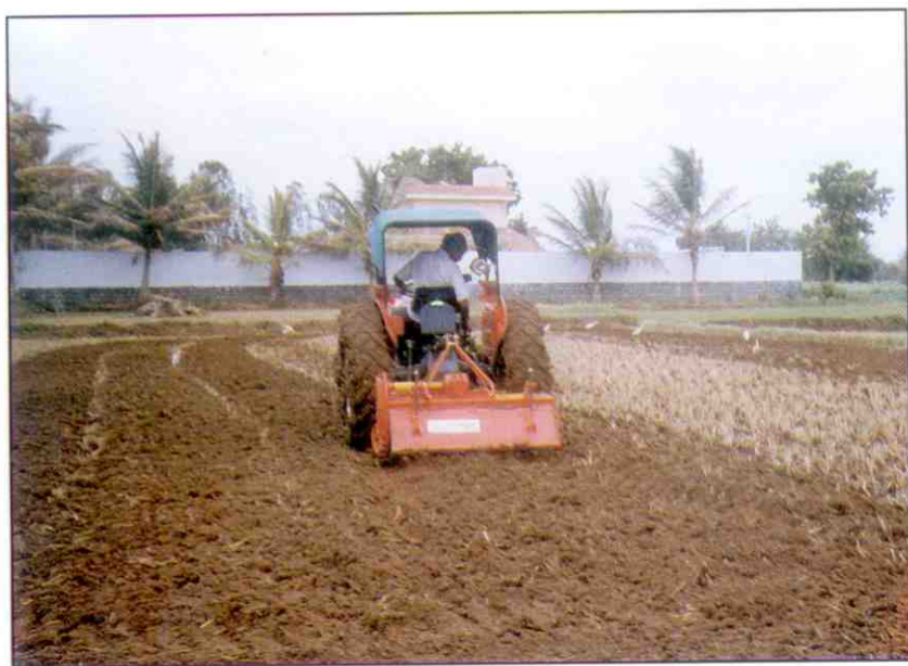
Fig 3 Field testing of Tractor mounted rotavator for seedbed preparation (dryland)

JNKVV, Jabalpur; PDKV, Akola; ANGRAU, Hyderabad; GBPUAT, Pantnagar; HAU, Hisar; KAU, Tavanur and MPKV, Pune centres carried out feasibility testing of tractor mounted rotavator covering about 250 ha area (Fig 3).