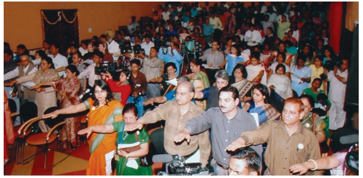
Pledging support against the practice of 'Female Foeticide' on the eve of International Women's Day (March 5, 2008 at YMCA, New Delhi)

5th March 2008: Workshop on Prevention of Female Foeticide at 10 AM at YWCA