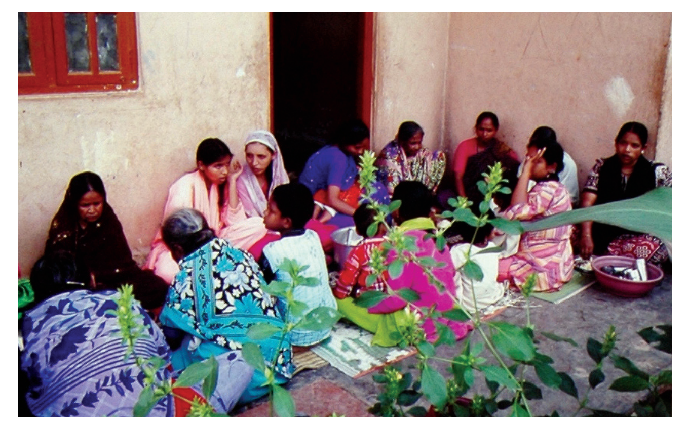
Swadhar Home- Inmates in a monthly group discussion in Banglore

2.29 This scheme was launched by the Ministry during the year 2001-02 for the benefit of Women in difficult circumstances with the following objectives: