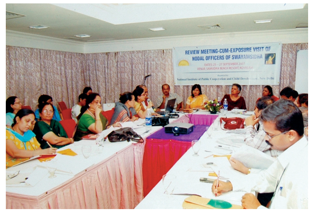
Review-cum-Exposer Visit of Nodal Officers of Sawayamsidha at Kovalam, Kerala (25-27th September 2007)

2.8 The Ministry has organized three exposurecum-review meetings of Nodal Officers implementing Swayamsidha, the details of which are as given below: