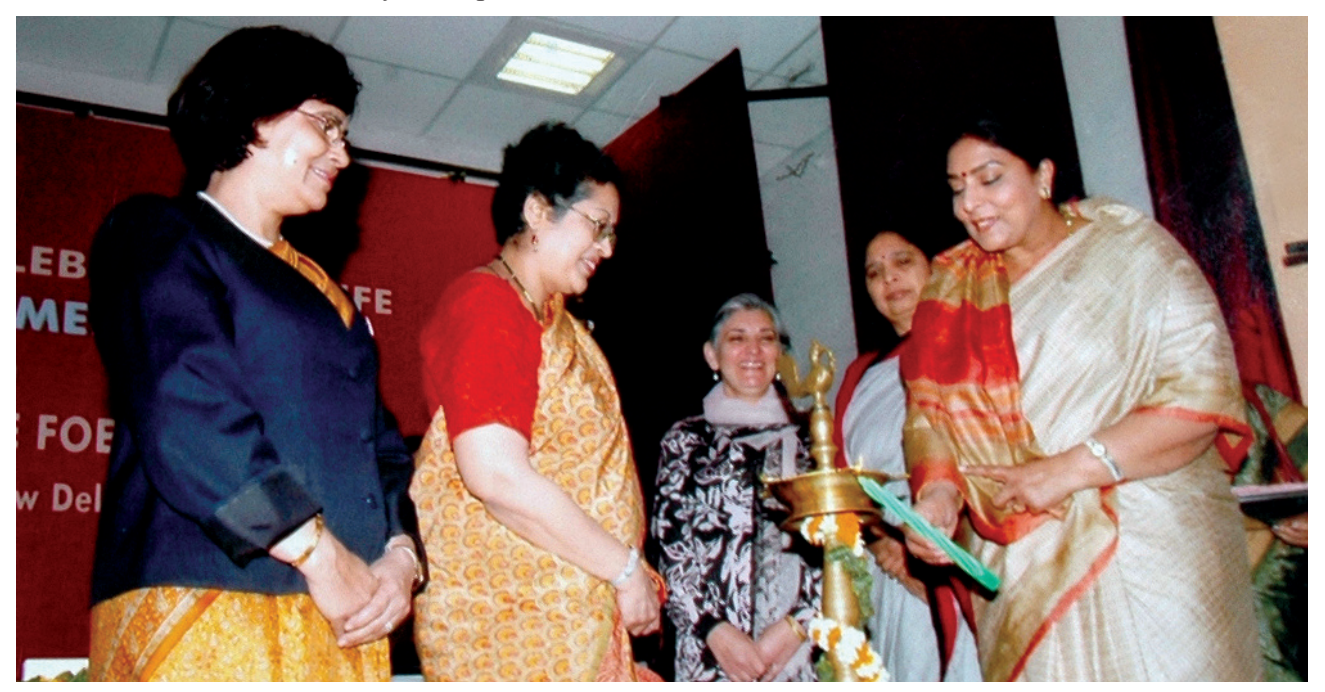
International Women's Day -Inauguration of Workshop on 'Prevention of Female Foeticide' by Hon'ble MOS(I/C), MWCD at YMCA, New Delhi on 5th March, 2008

revolved around three themes viz., Girl Child, Trafficking and Eve Teasing.