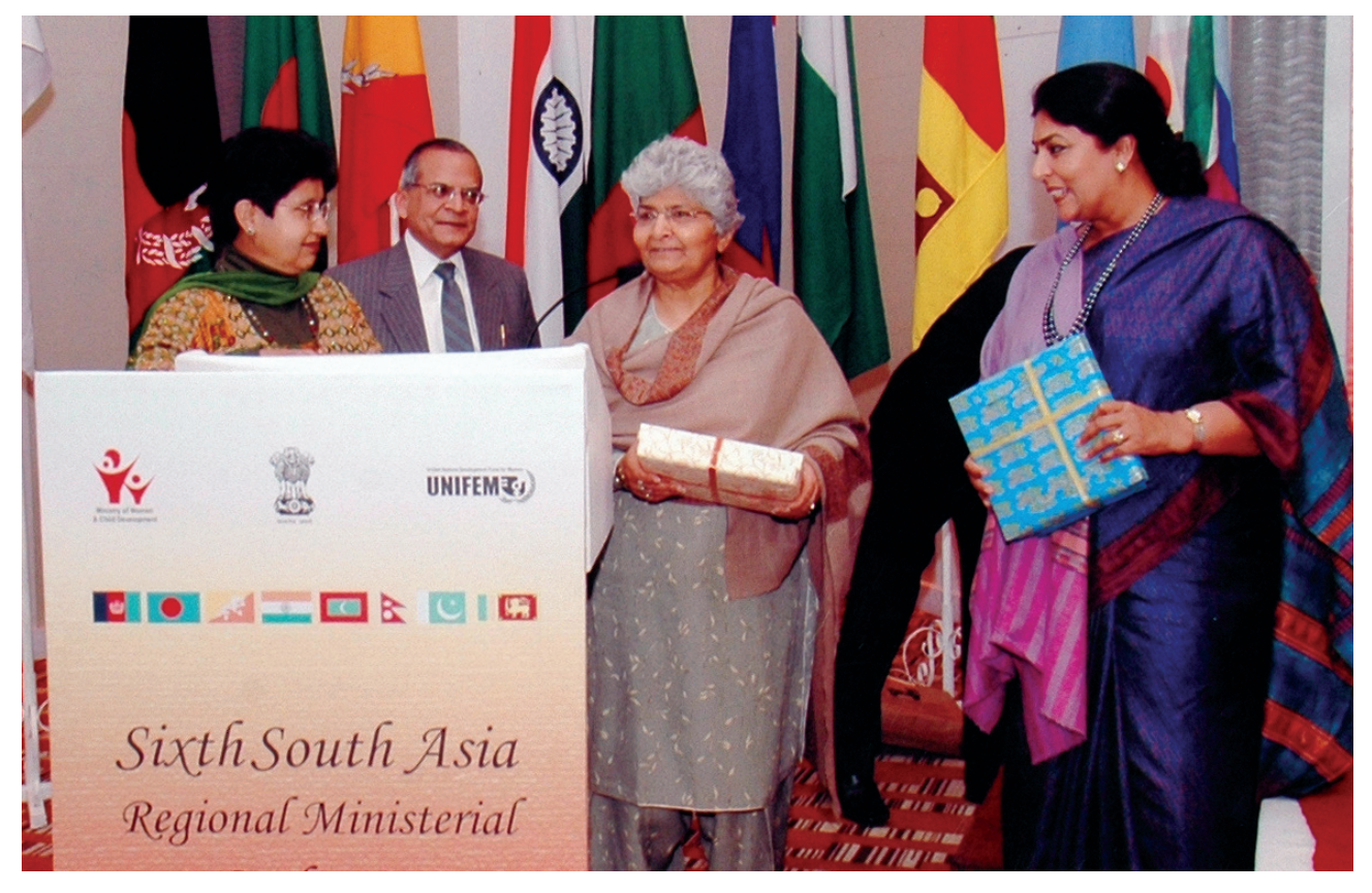
Smt. Renuka Chowdhury, MOS(I/C), MWCD with Leader of Pakistan Delegation in the Sixth South Asian Regional Ministerial Conference(17-19th January, 2008)

2.55 The Sixth South Asia Ministerial Conference was held in New Delhi from 17-19 January 2008. All the SAARC countries including Afghanistan represented. The conference were was inaugurated by the Honourable President of India. The SAARC Secretary General also attended the inaugural function. This meeting is held once in every two years to review the action taken and progress made by the respective Governments on the Beijing Platform for Action which has become a base document for measuring gender justice and women's empowerment This conference initiated by UNIFEM-South Asia Regional Office in September 1996, brings together governments, NGOs and member of the civil society. In pursuance of the Islamabad Declaration : Review and Future Action adopted in the last meeting in 2005, this meeting brainstormed and strategized on some critical concerns related to gender