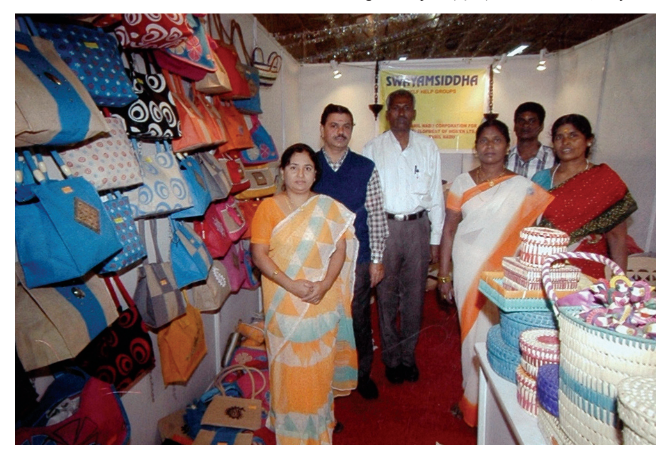
Swayamsidha women's SHG- Towards Economic Empowerment in Tamil Nadu

a total budget outlay of Rs. 116.30 crore. But subsequently discontinued from Goa, Daman & Diu, Dadar & Nagar Haveli and Chandigarh due to lack of interest among the UTs. The scheme is expected to culminate in March 2008. The long-term objective of the programme is holistic empowerment of women through a sustained process of mobilization and convergence of all the on-going sectoral programmes by improving access of women to micro credit, economic resources etc. The programme is being implemented in 650 blocks in the country including 238 Indira Mahila Yojana (IMY) blocks, covering 335 districts. Each block consists of 100 Self Help Groups. The programme is being implemented in many States through ICDS infrastructure; while in some States, the scheme is implemented through State Women's Development Corporations. In addition to monitoring the scheme through normal means such as Quarterly Progress Report (QPR) and field visits, a system