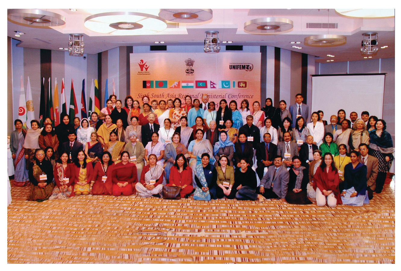
Participants of the Sixth South Asian Regional Ministerial Conference(17-19th January, 2008)