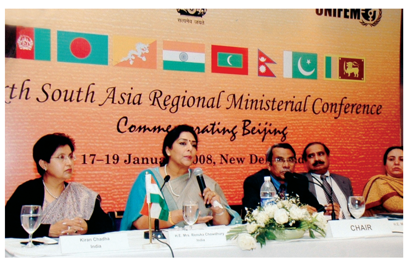
Sixth South Asian Regional Ministerial Conference(17-19th January, 2008)