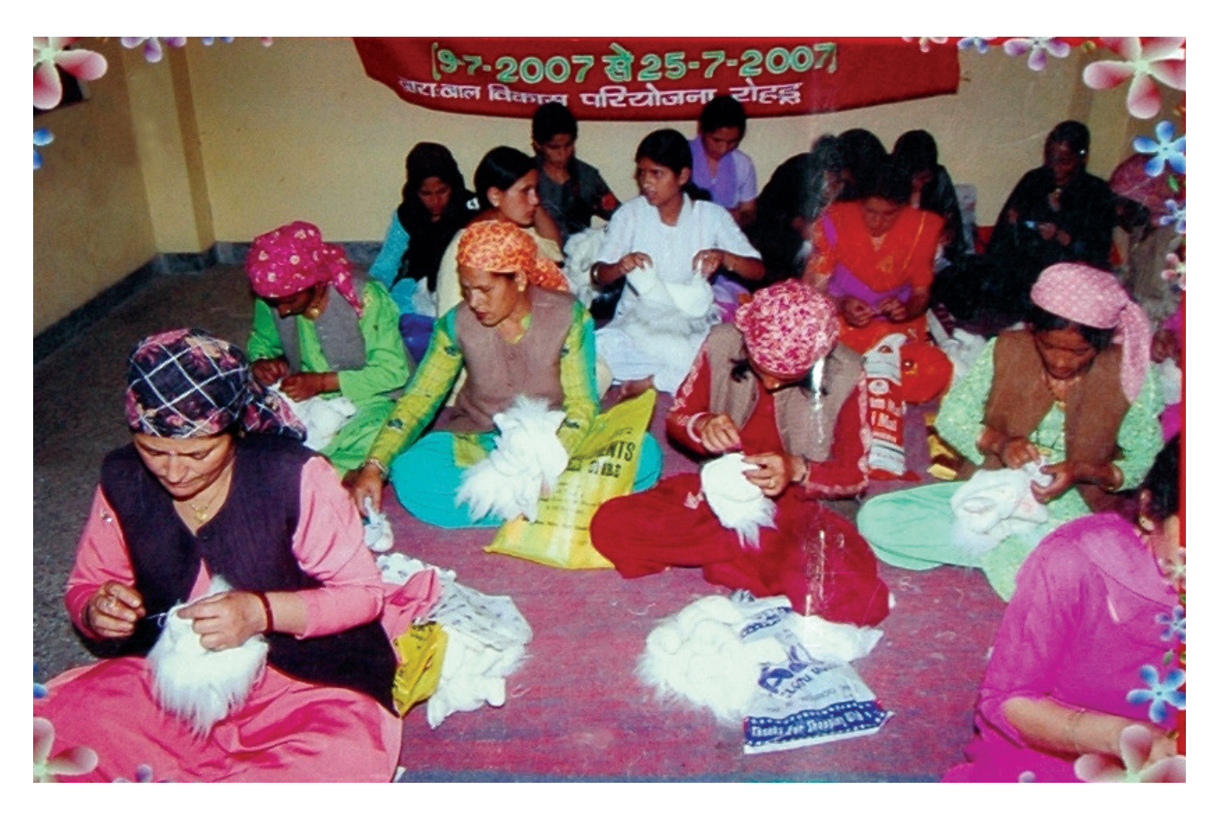
Soft Toy Training Unit in Himachal Pradesh under Swayamsidha Scheme

of Quarterly Review Meetings of State Nodal Officers has been put in place.