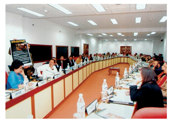
Combating Trafficking- Central Advisory Committee setup to discuss related issues at Vigyan Bhawan, New Delhi (13th December 2007)

Ministry of Home Affairs organized the "South Asia Regional Conference on Human Trafficking" as a part of the Global Initiatives to Fight Human Trafficking (UN-GIFT). The Conference provided an effective platform to generate awareness on various issues relating to trafficking and