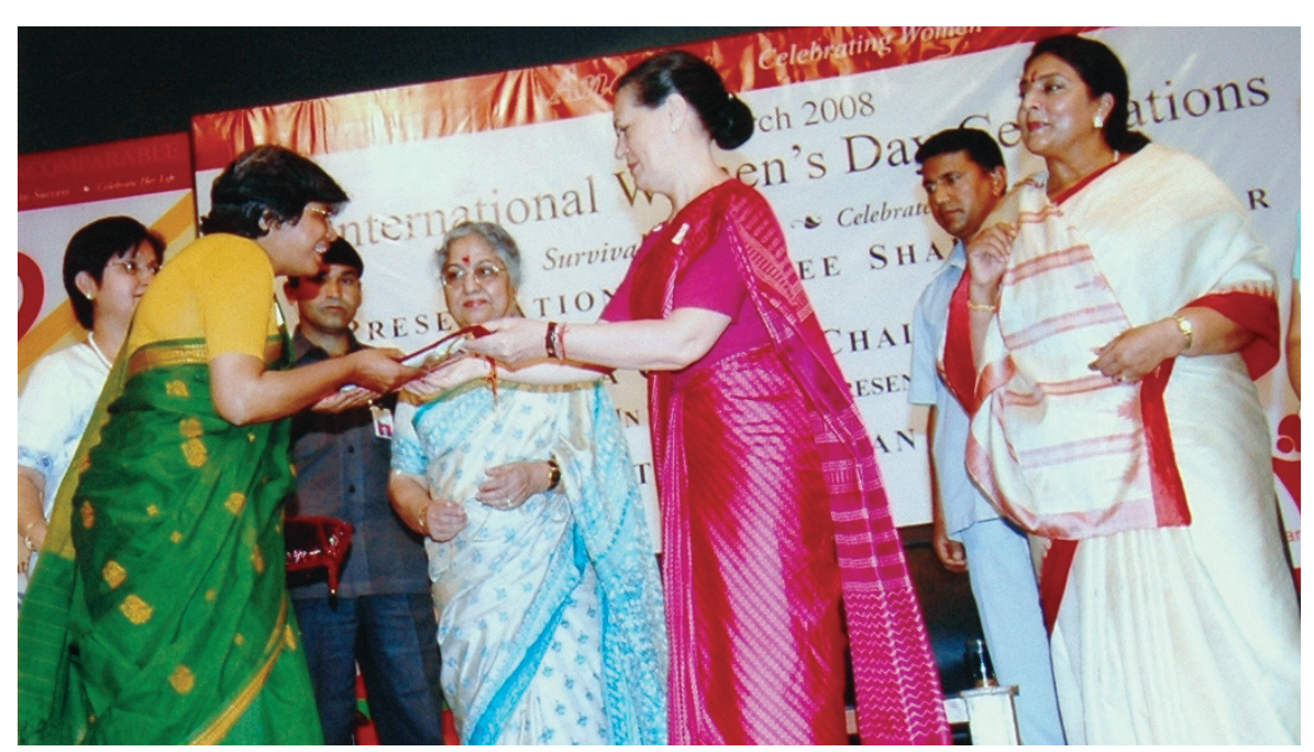
Smt. Sonia Gandhi , Chairperson, UPA flanked by Smt. Renuka Chowdhury, Hon'ble Minister of State(I/C), MWCD during International Women's Day 2008

A weeklong celebration has been organised beginning 3rd March 2008 with press conference as curtain raiser followed by the following activities: