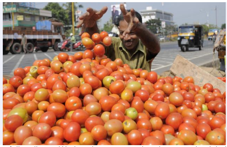
After witnessing a fall earlier on Wednesday, tomato prices have regained their upper levels on account of lower availability of stocks.

KARNAL, MARCH 3: Lower arrivals in the market pushed up tomato prices on Sunday by Rs 100-150 a quintal for the different varieties.