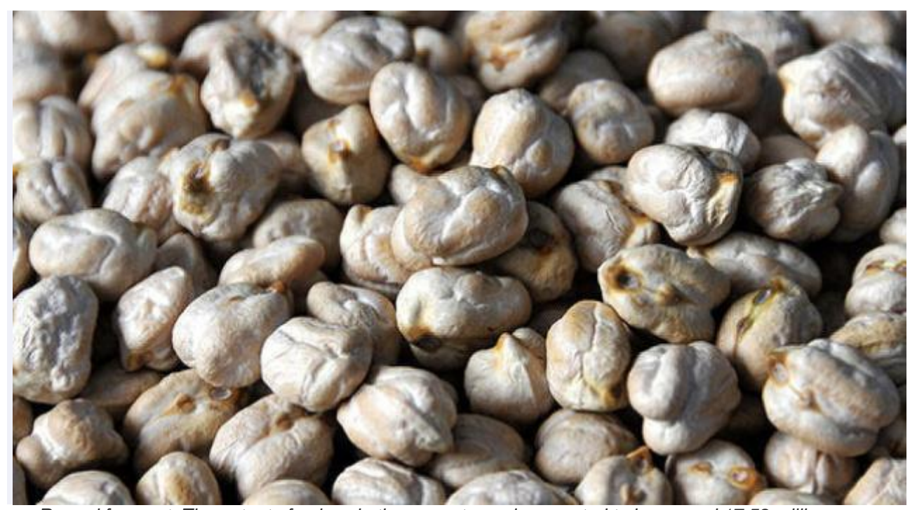
Record forecast: The output of pulses in the current year is expected to be around 17.58 million tonnes with chana harvest pegged at record 8.57 mt.

NEW DELHI, MARCH 3: Import of pulses may drop by about a tenth to around 3 million tonnes (mt) next fiscal on a larger chana (gram) crop this year.