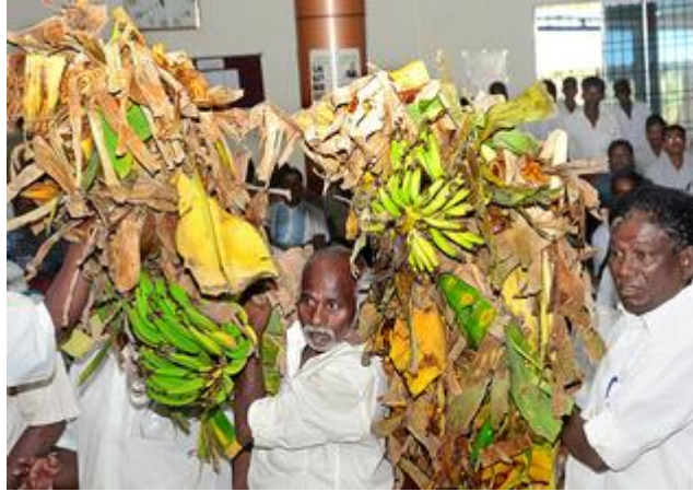
STEM THE ROT: Farmers showing their withered banana plants to the Collector at the grievances day meeting in Tiruchi on Friday.

the respective bank accounts. Only 11,676 farmers had chosen to withdraw Rs. 21.82 crore so far, she said.