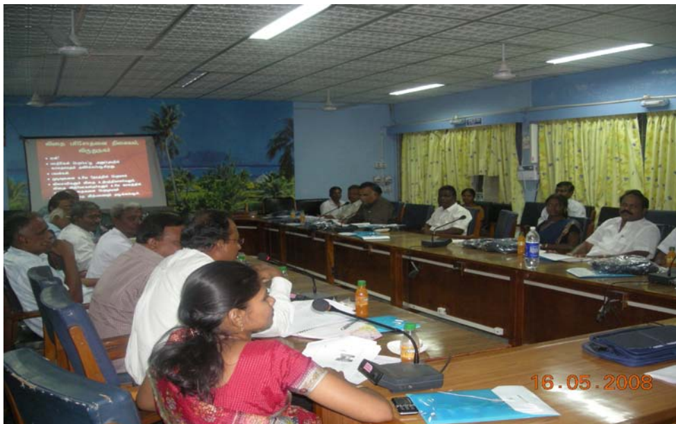
Line Department Officials