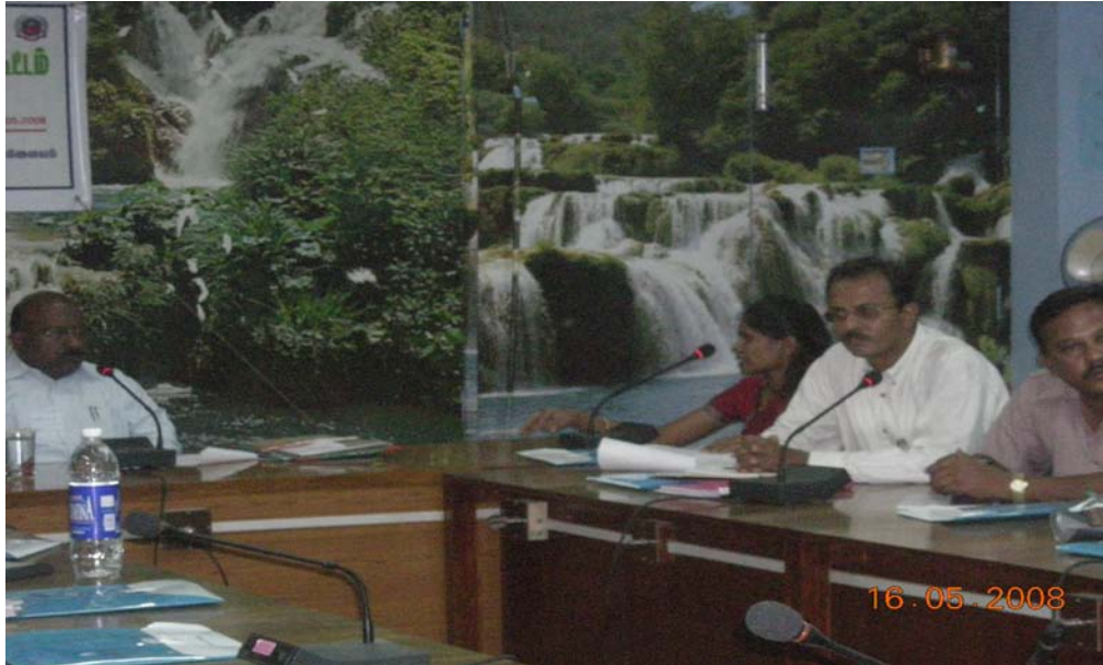
TNAU Scientist explaining about the District Agriculture Plan