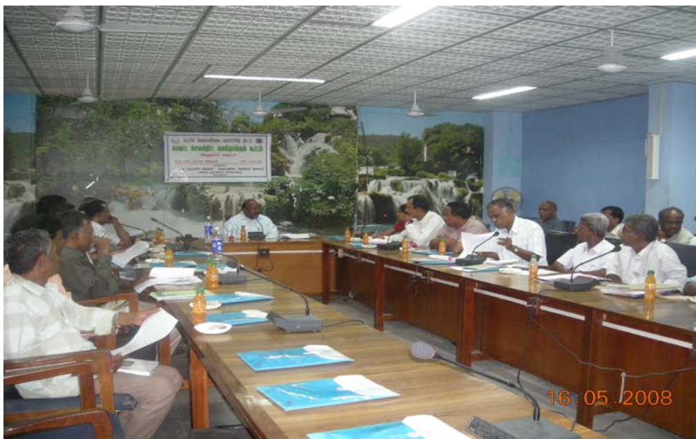
District Collector Addresses the Participants