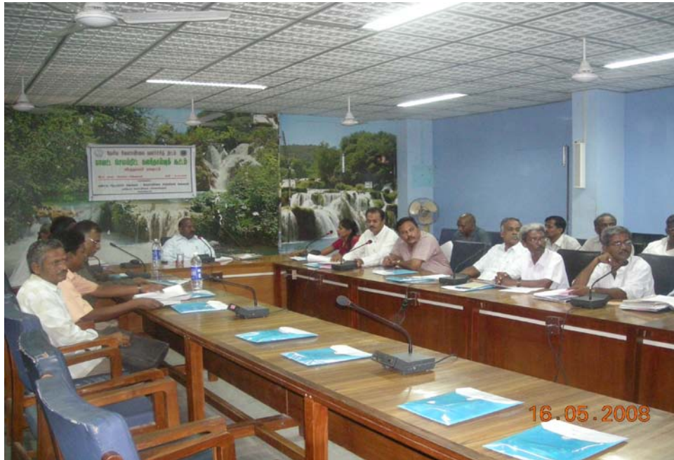
A View of the Participants