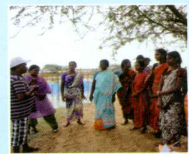
Motivating the WSHGs beneficiaries