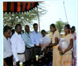
Seabass seed distribution to the WSHGs beneficiaries