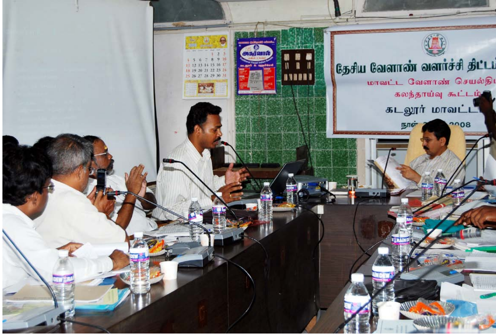
Participants in the meeting (Farmers, Officers from Line Departments, Elected Members, etc.)