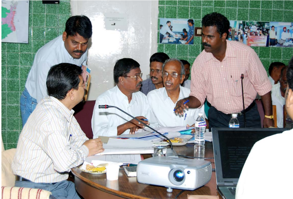
Agricultural Officers explaining about the Soil Testing Mobile Van