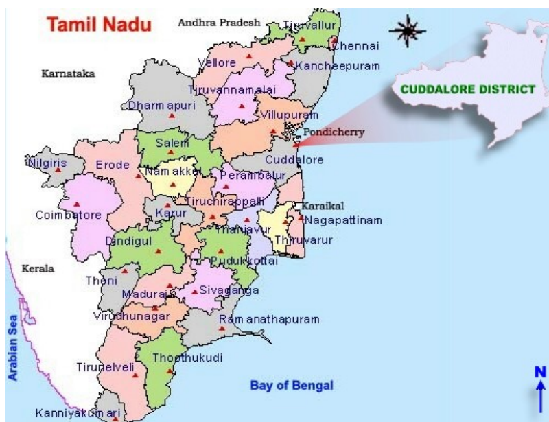
Fig 1. Map Showing the Location of Cuddalore District