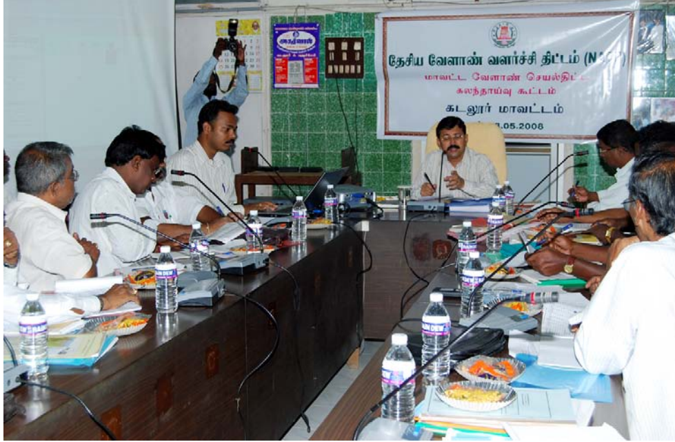
District Agriculture Plan Meeting chaired by District Collector, Cuddalore