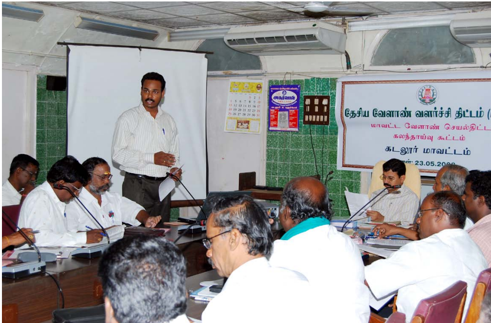
District Agriculture Plan presented by the TNAU Scientist