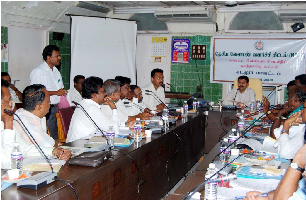
Agricultural Engineer explaining the Concept of Control of Sea Water Intrusion