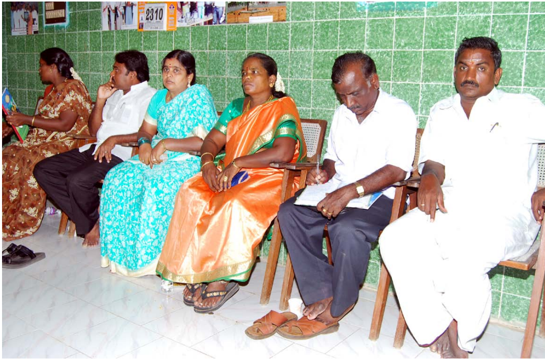
Elected Members from Various Parts of Cuddalore District