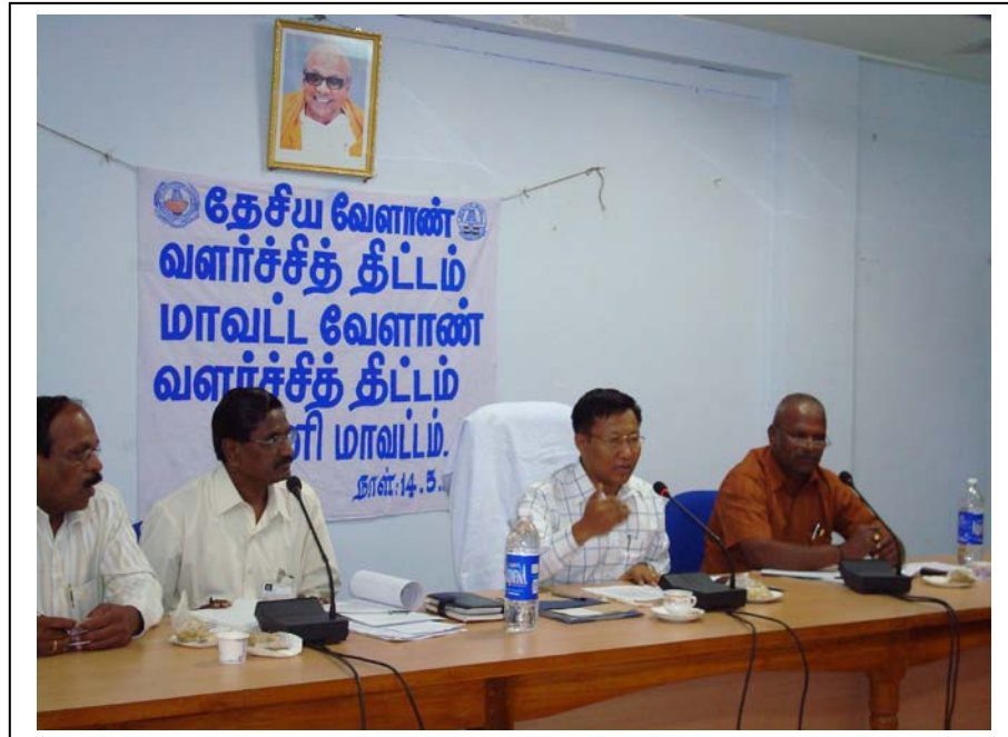
Address by Theni District Collector