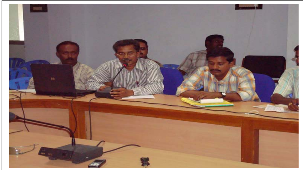
Proposal Presentation by the TNAU Scientist