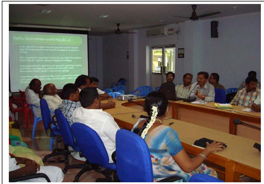
Interaction by TNAU Scientists with Participants