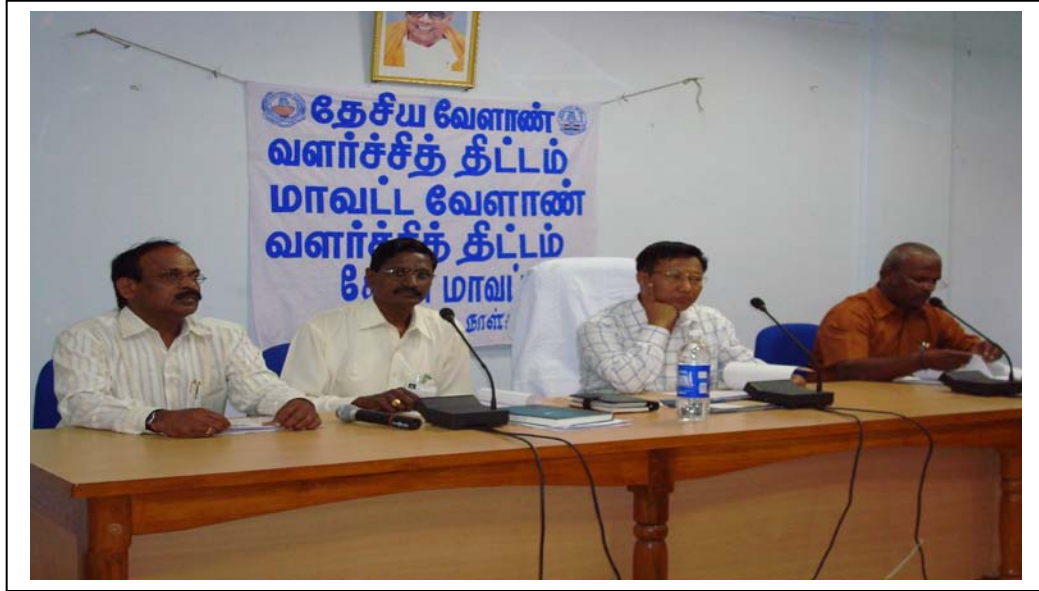
Observation by Theni District Collector