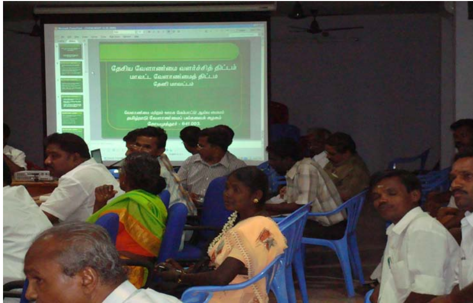
Participants of Interactive Meeting