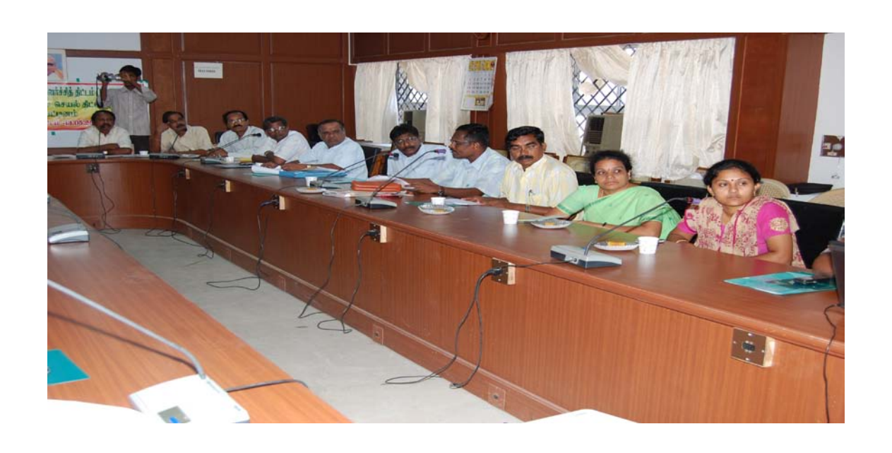
Participants of the meeting