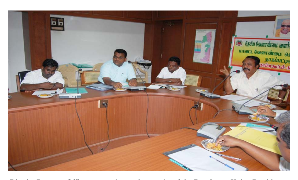
District Revenue Officer answering to the queries of the Panchayat Union President