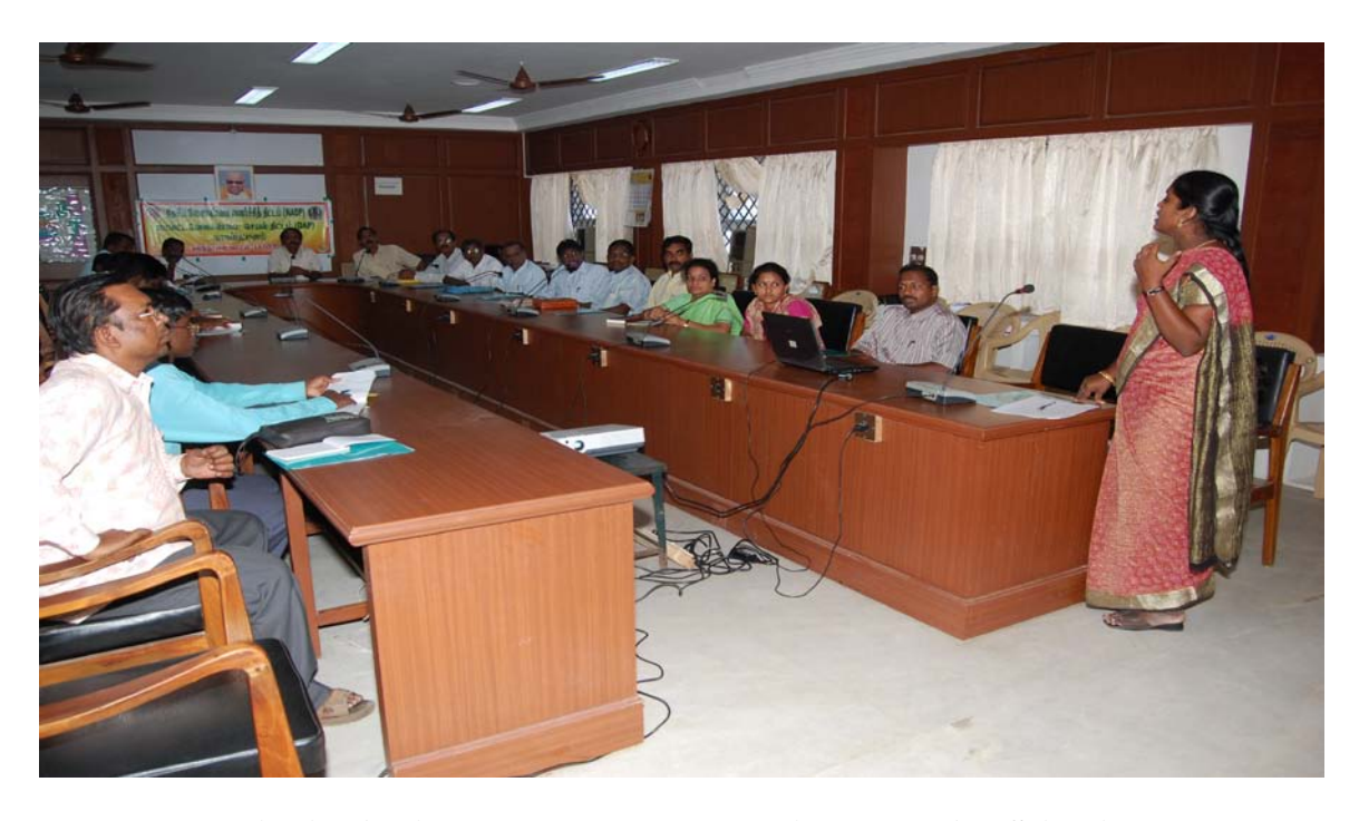
District Agriculture Plan – Presentation by TNAU Scientist