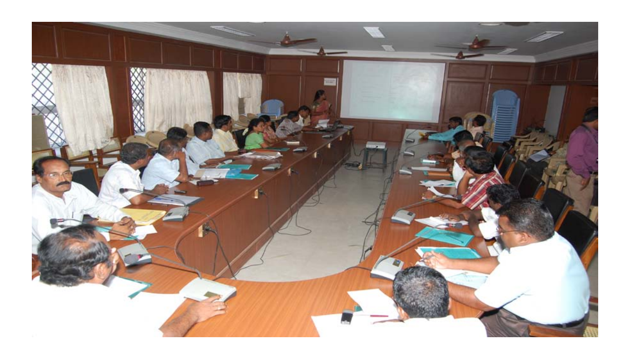
Discussion by Line Department Officials regarding District Agriculture Plan