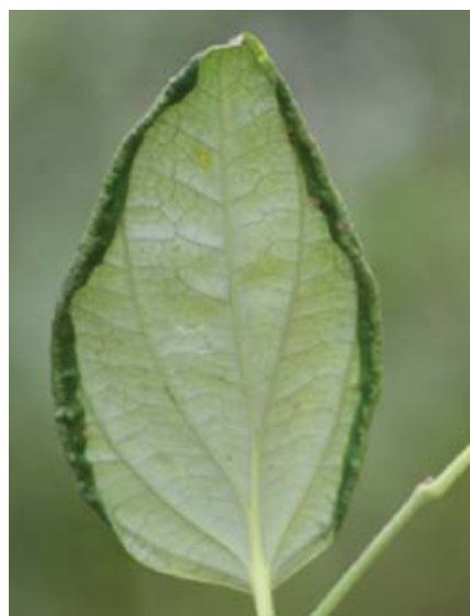
Leaf gall thrips damage