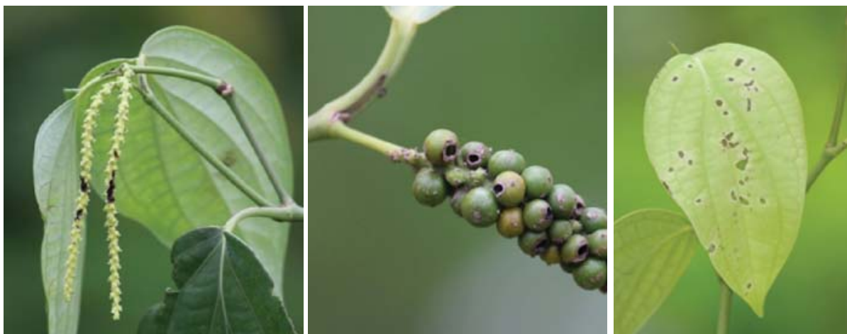
Pollu beetle damage

Pollu beetle ( Lanka ramakrishnai ) is the most destructive pest of black pepper and is more serious in plains and at altitudes below 300 m. The adult beetles feed and damage tender leaves and spikes. The grubs bore into berries and feed on the internal tissues and the infested spikes turn black and decay. The infested berries also turn black and crumble when pressed. The pest infestation is more serious in shaded areas in the plantation. The pest population is higher during September-October in the field.