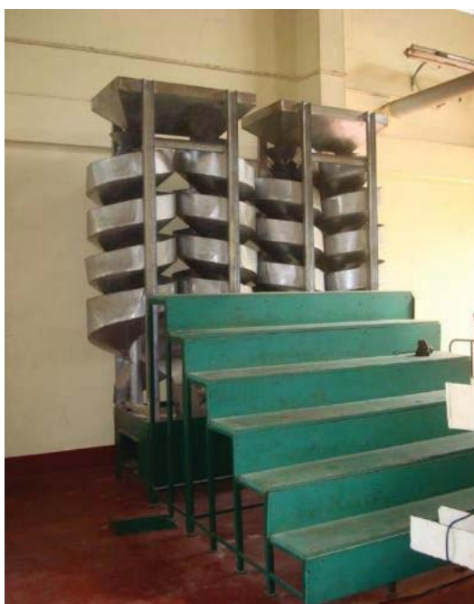
Black pepper spiral separator