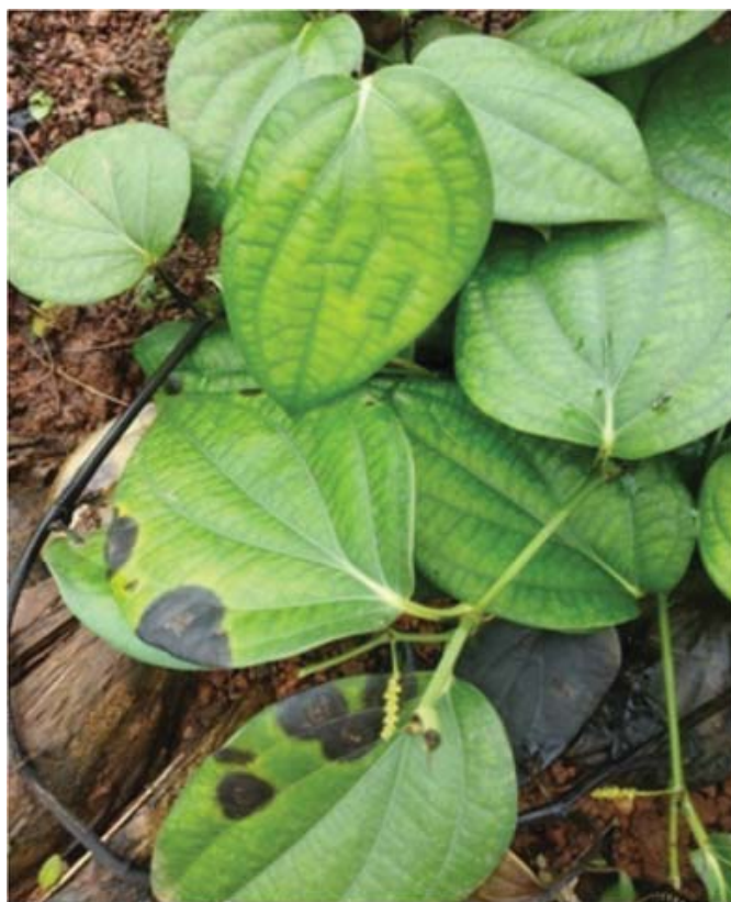
Phytophthora infection on leaves