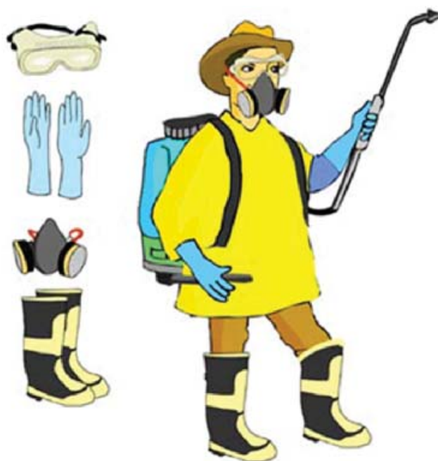
Protective clothing for workers