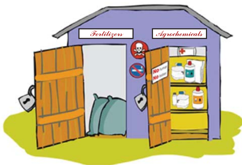
Inputs storage shed