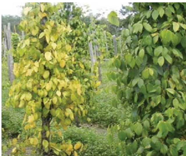
Slow wilt disease