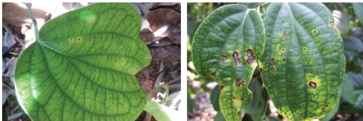
Anthracnose /Pollu disease

This disease is caused by Colletotrichum gloeosporioides . It can be distinguished from the pollu (hollow berry) caused by the beetle by the presence of characteristic cracks on the infected berries. The disease appears towards the end of the monsoon. The affected berries show brown sunken patches during early stages and the discolouration gradually increases with characteristic cross splitting and finally the berries turn black and dry. The fungus also causes angular to irregular brownish lesions with a chlorotic halo on the leaves. The disease can be managed by prophylactic spraying of Bordeaux mixture (1%) or carbendazim - mancozeb (0.1%). Drench and spray with Pseudomonas fluorescens P1 (2%) during May – June and October for foot rot and anthracnose management