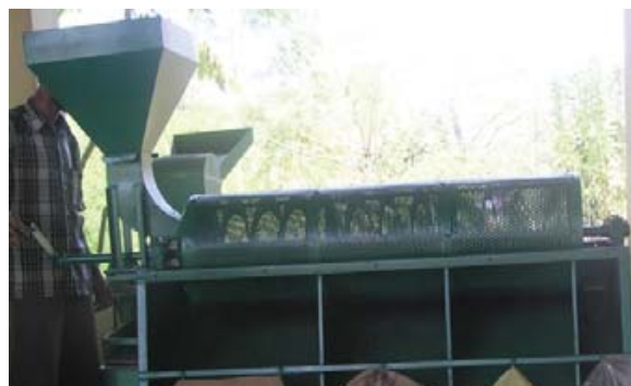
Black pepper cleaner cum grader