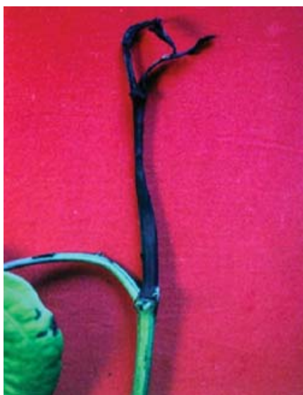
Top shoot borer damage

Infestation by leaf gall thrips ( Liothrips karnyi ) is more serious at higher altitudes especially in younger vines and also in nurseries in the plains. The feeding activity of thrips on leaves causes the leaf margins to curl downwards and inwards resulting in the formation of marginal leaf galls. Later the infested leaves become crinkled and malformed. Spray dimethoate (0.05%) during emergence of new flushes in young vines in the field and cuttings in the nursery.