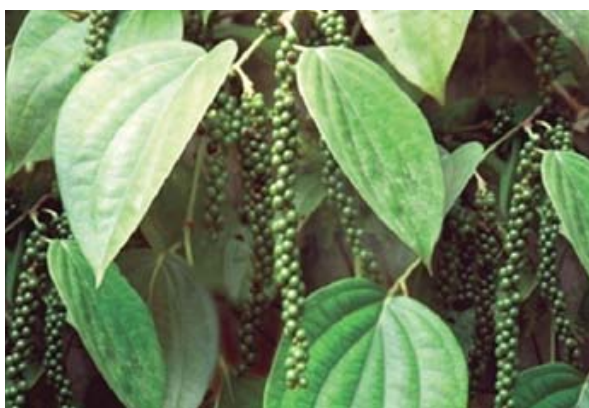
IISR MALABAR EXCEL