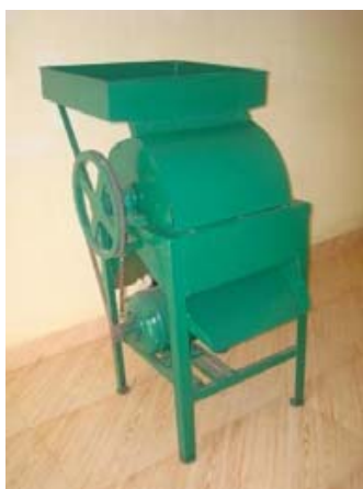
Black pepper thresher