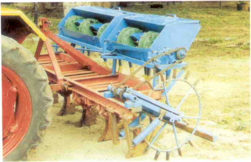
Fig. 1: Tractor mounted cultivator seed planter