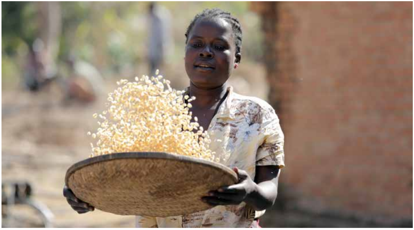
Female Soya Farmer at the Anchor Farm Project. A female farmer cleans soya in Malawi at the Clinton Development Initiative (CDI) Anchor Farm Project. The Anchor Farm Project operates five commercial farms in the Kasungu and Mchinji districts of Malawi and partners with 21,000 neighboring smallholder farmers, providing them with access to quality inputs for maize and soy production as well as training and market access.

Women in particular have benefited from growing soybean, because it is a fast growing legume that fetches good market prices compared to other legumes such as common beans, peas and pigeon peas. Women also use soybeans to feed their families, which in itself has increased demand for the crop. The income farmers earn from selling soybean is used to pay for school fees and medical expenses, farm inputs and home improvements. Some have invested in non-farm businesses such as grocery stores, and project communities are undergoing an economic revolution.