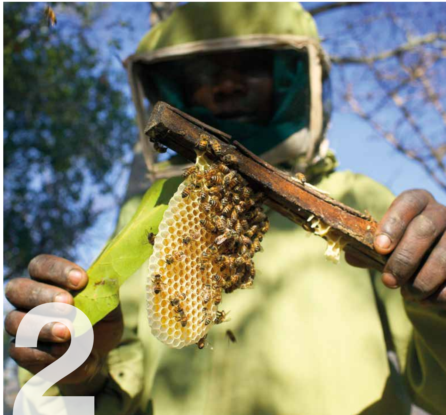
A beekeeping project in the village of Utosi, Tanzania.