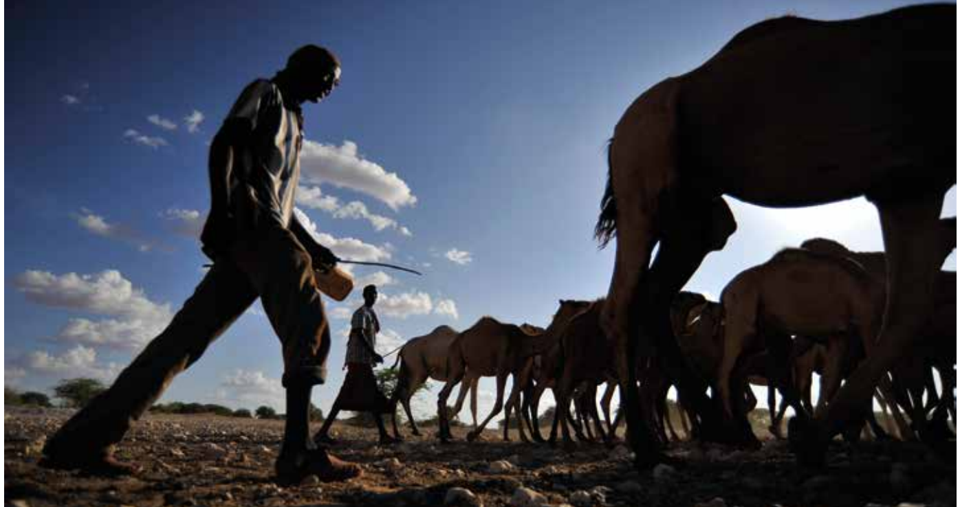
Weather-based insurance in Kenya covers pastoralists for livestock losses in drought conditions, resulting in fewer distress sales of animals and less reliance on food aid.

Insurance may be an important mechanism for farmers to break the cycle of low input, low output farming. The challenge now is to scale up the many pilot schemes and make insurance easily available to the smallest smallholder farmers.