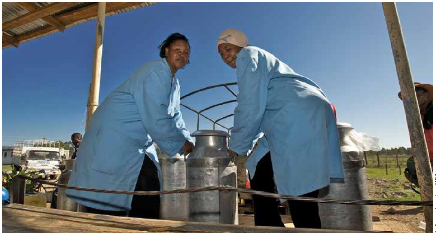
Milk delivered to the chilling plants established through the project can be sold into formal dairy markets and offers better quality milk for traditional markets.

The project also supports the development of agricultural practices that mitigate climate change. Better livestock feeding and manure management have potential to reduce greenhouse gas emissions and increase farmers' incomes. The project is therefore experimenting with techniques like fodder banks, improved pasture species, feed legumes and the use of crop by-products for livestock feed to achieve these twin climate change mitigation and improved livelihood goals.