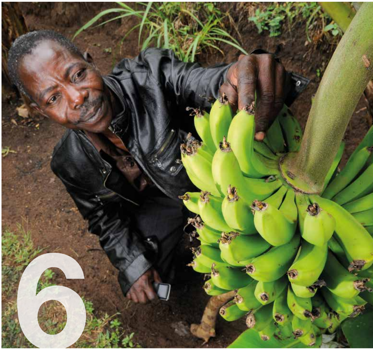
A farmer in Western Kenya uses agroforestry and intercropping on his small plot of land. His approach to sustainable intensification boosted food production, increased resilience to climate change, and helped develop a profitable business.