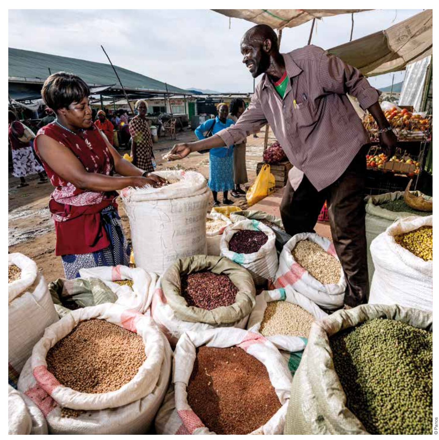
People selling seeds and beans in a market in the town of Wote, Kenya.