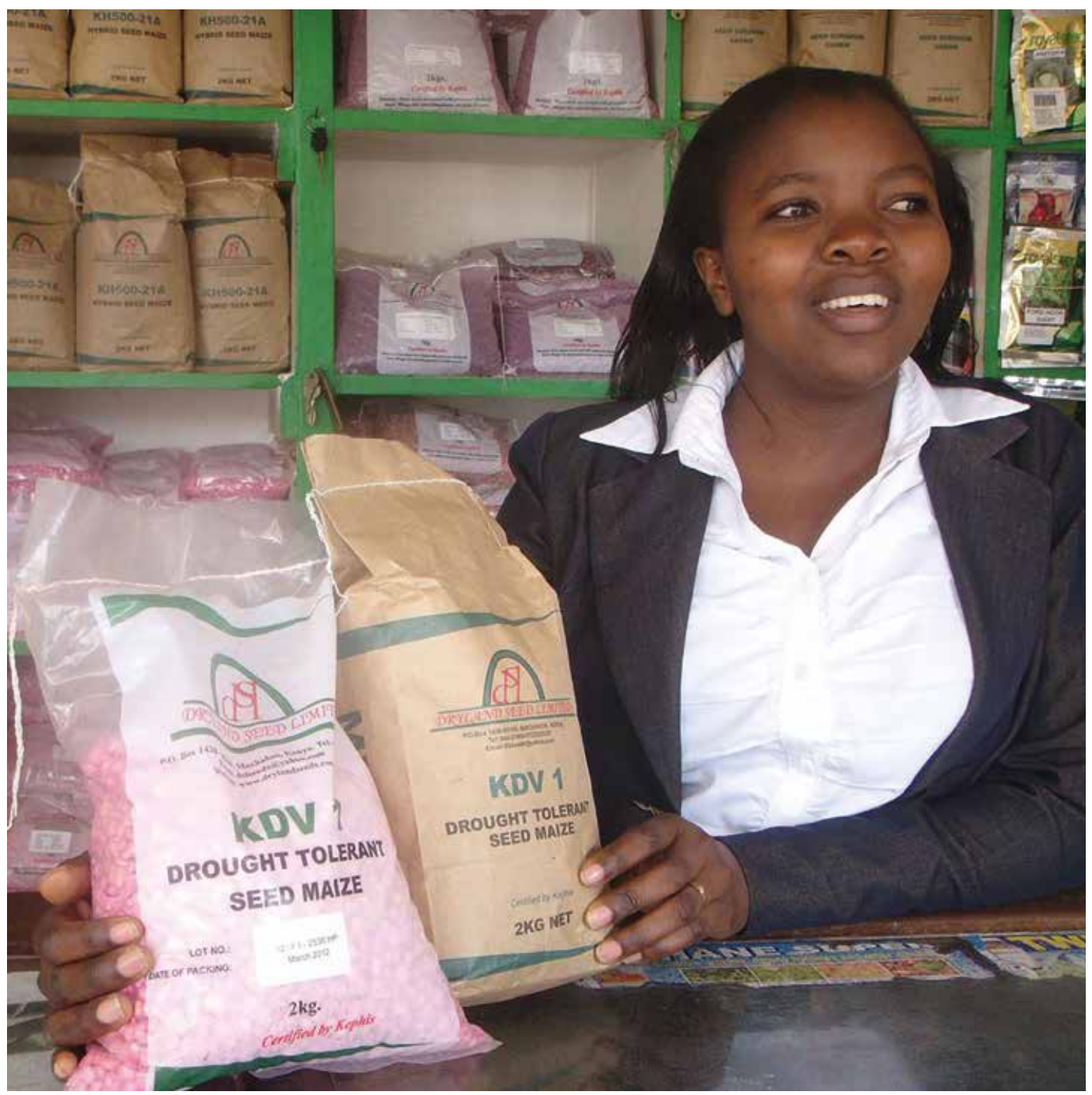
An attendant displays KDV1 drought-tolerant seed at the Dryland Seed Company shop in Machakos, Kenya.