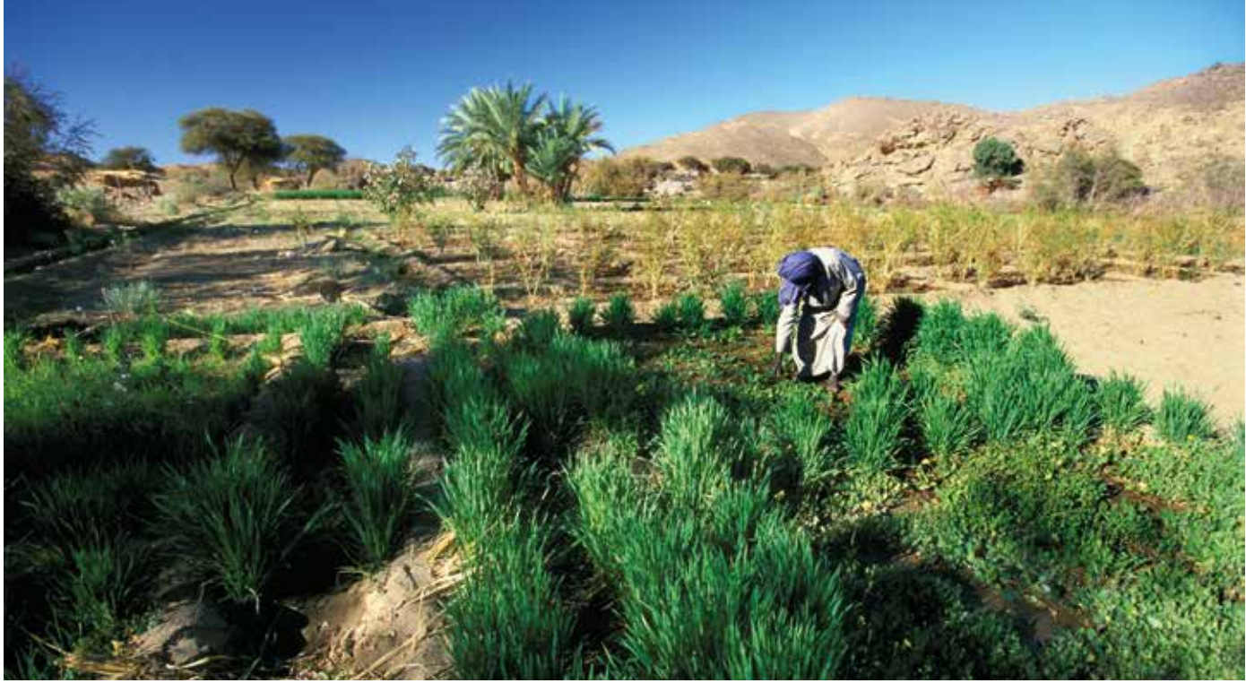
A man of the Tuareg tribe in Tamanrasset, Algeria, harvesting beans.

At a multitude of levels, and through interventions of many different types, this programme seeks to help farmers move towards more resilient, droughtresistant and climate-smart agricultural practices.