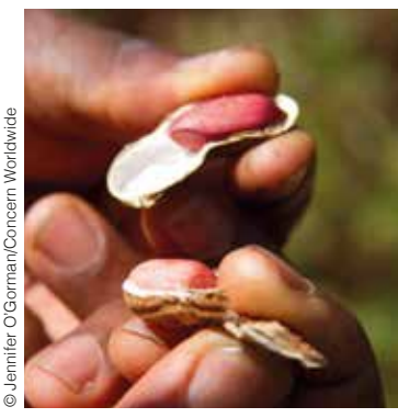
Doris Malinga showing her ground nut crop to show how conservation agriculture has benefitted her. Dwerog Field, Kabudula, Lilongwe District, Malawi.

Conservation agriculture brings many other benefits. The absence of tillage and weeding, and the maintenance of good soil cover, mean that rainfall is captured better. Soil structure improves and organic matter increases, as well as populations of beneficial termites and earthworms. Intercropping with legumes improves soil health and reduces pests and diseases; it can also produce an extra crop, offering farming families a more nutritious diet or extra income. There are significant benefits from savings in labour too, allowing farmers time to expand production, or diversify into other ventures.