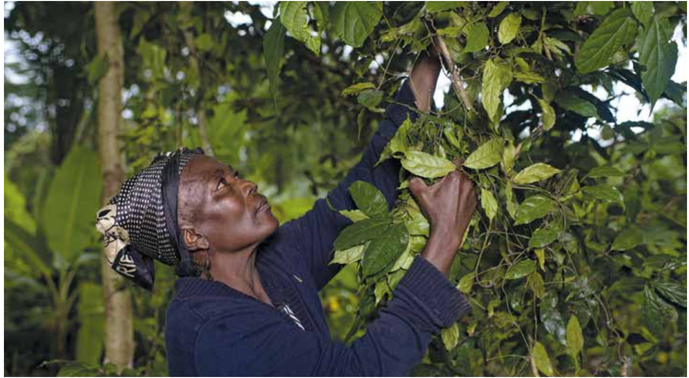
A woman harvests all the leaves from Gnetum spp. (okok) in the village of Minwoho, Lekié, Center Region, Cameroon.

HaSSP is funded by the Swiss Agency for Development and Cooperation and managed by the Food, Agriculture and Natural Resources Policy Analysis Network (FANRPAN). It has a total budget of US$4.8 million.