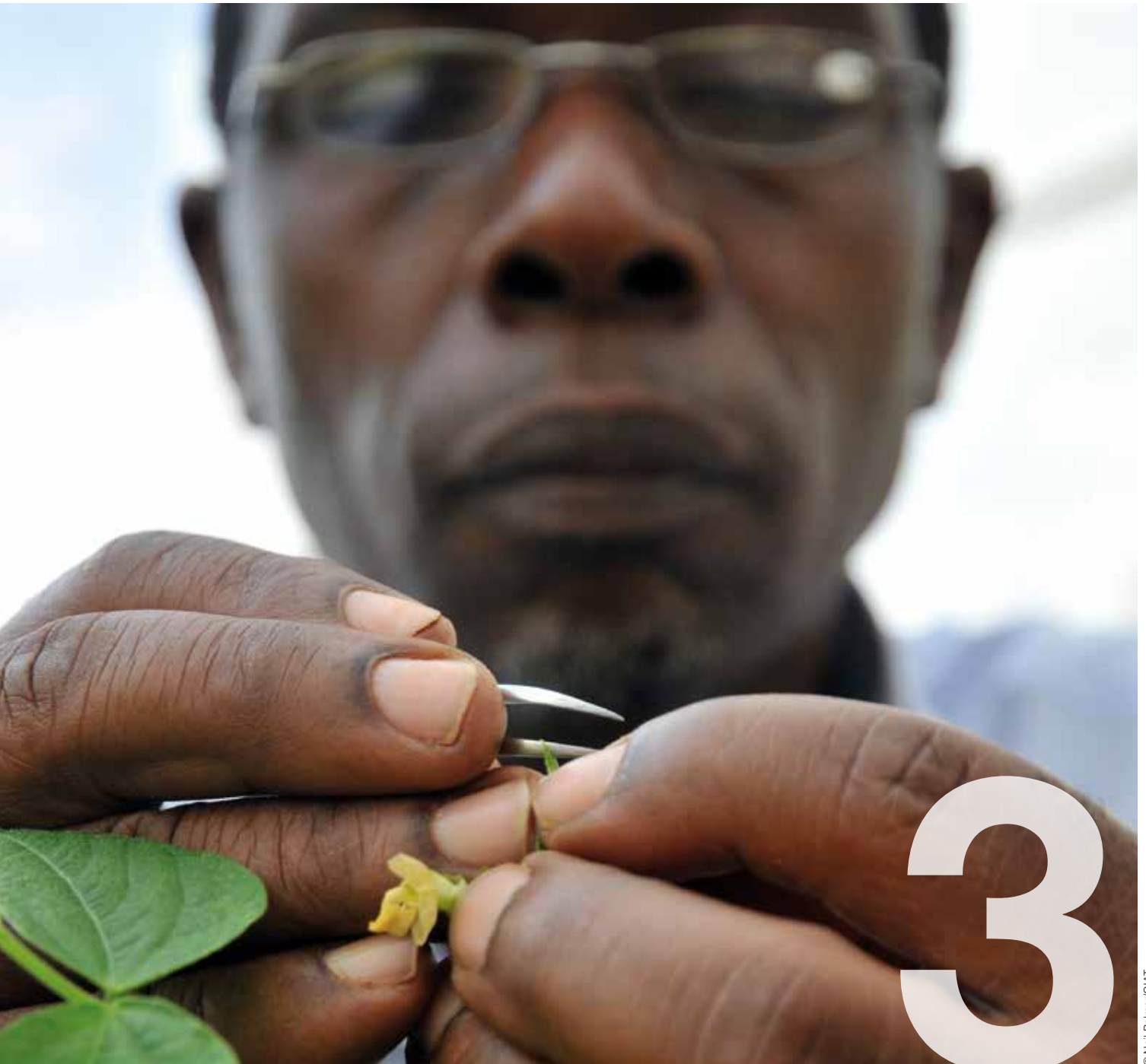
Bean breeding at CIAT in Kawanda, Uganda.