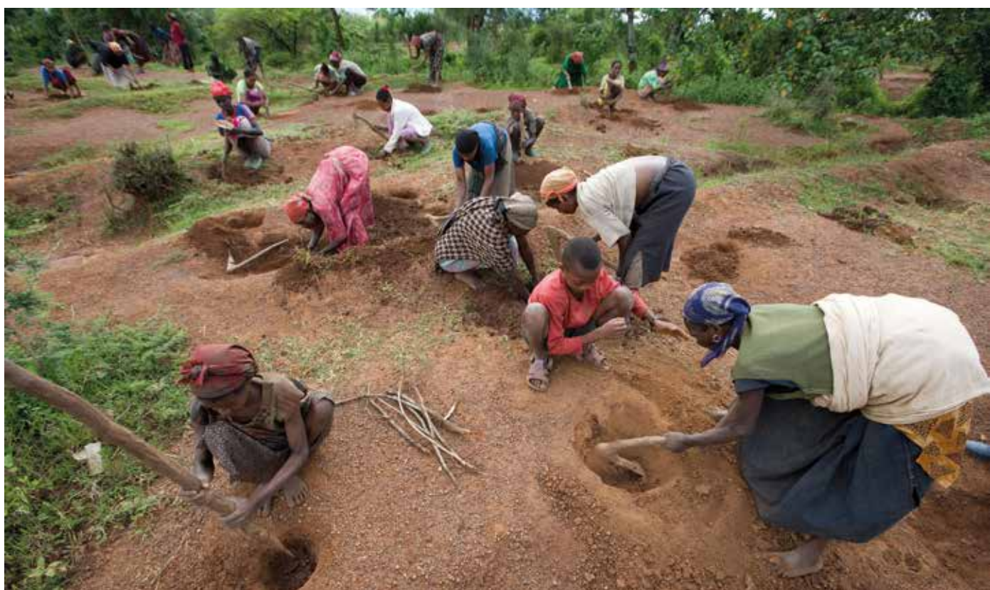
People from Ukamo village in Ethiopia take part in a tree planting project.