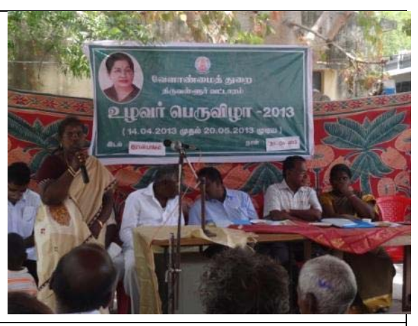
Programme Coordinator explain the activities of KVK