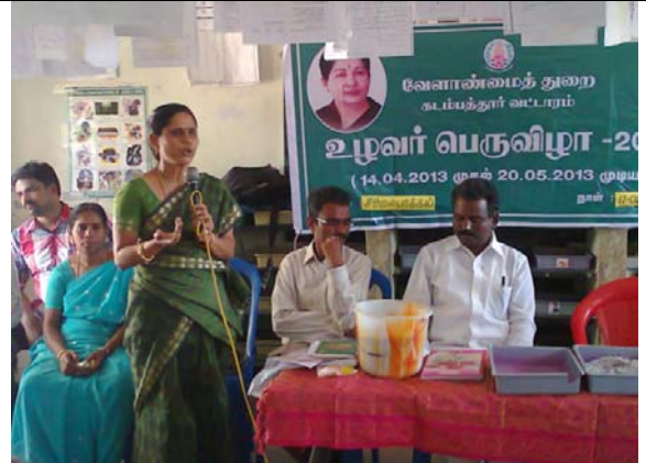
Demo on seed treatement in paddy Chitrrampakkam